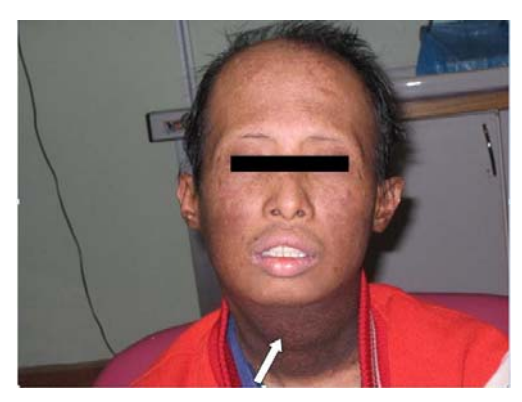
Figure 3: Radiation-induced cutaneous reaction with inflamed skin, hyperpigmentation and areas of skin breaks in the neck after completion of treatment.

the tumor recurred and the patient died 16 months after diagnosis of SCC.