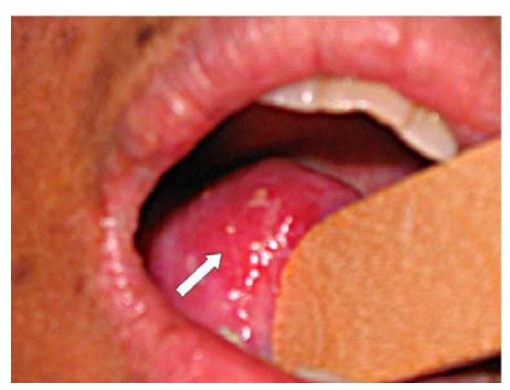
Figure 1: There is an ulcer at the right side of the posterior base of the tongue.

from 26.3kg to 25.1kg, BMI dropped from 13.2 to 12.6). Physical examination revealed a 3.0cm x 3.5cm ulcer at the right side of the posterior base of his tongue (Figure 1). Biopsy of the ulcer confirmed the presence of a well-differentiated SCC (Figure 2). It was staged as T2N2CM0 according to the 1998 American Joint Committee on Cancer (AJCC) staging system (American Joint Committee on Cancer, 1998).